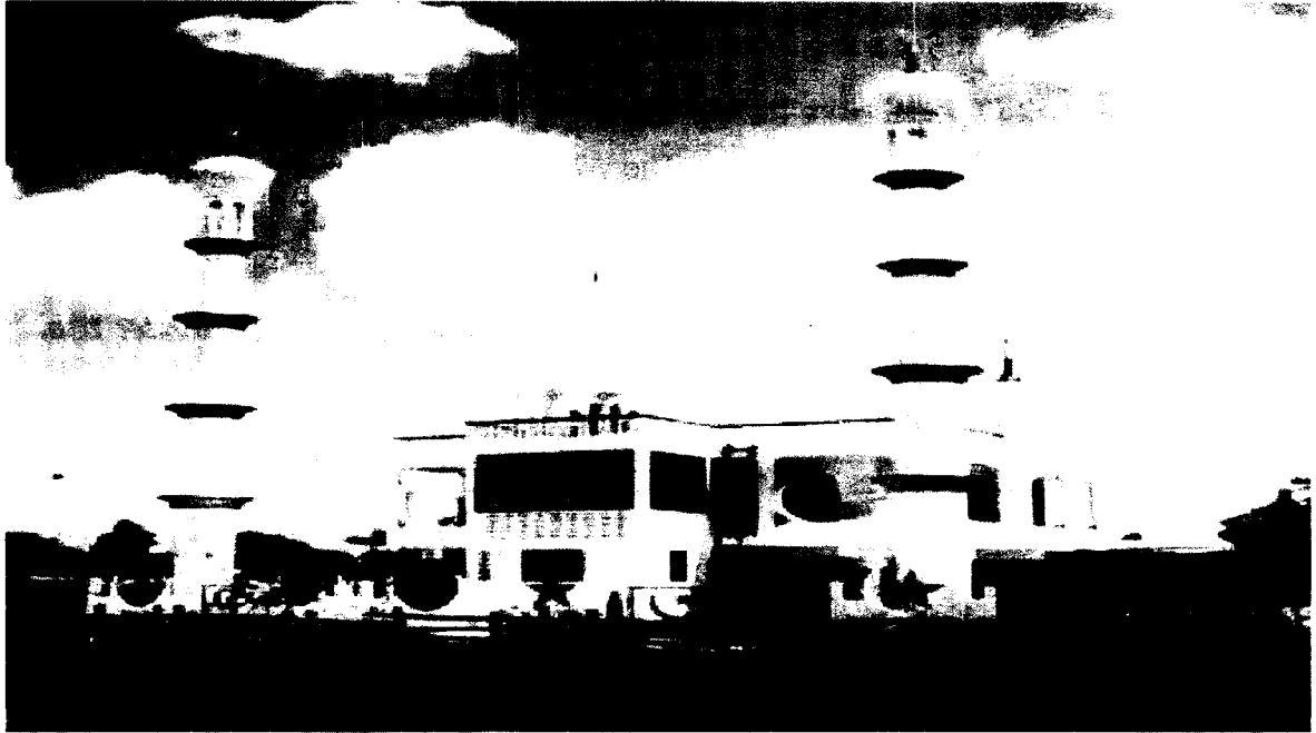
Mosque belonging to the AAII, Suriname